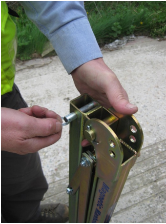
Remove locking pin