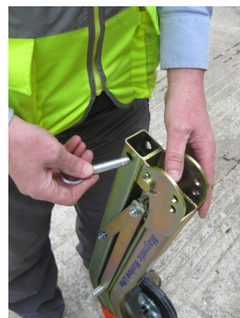
Replace locking pin on frame

Take care to avoid pinching or trapping fingers when folding the trolley. Refer to the Manhole Buddy User Guide for full operating instructions.