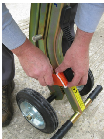
Refit Velcro strap