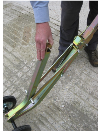
Fold front arm back against frame