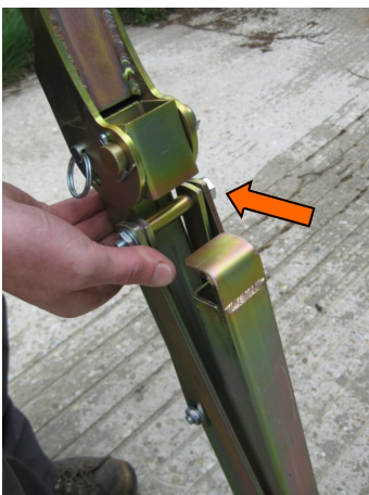
Press stay bars inwards to release front arm

Straight handle (left) is most common configuration. Cranked handle (right) may be applicable on raised covers or where the user stands on higher ground near the cover.