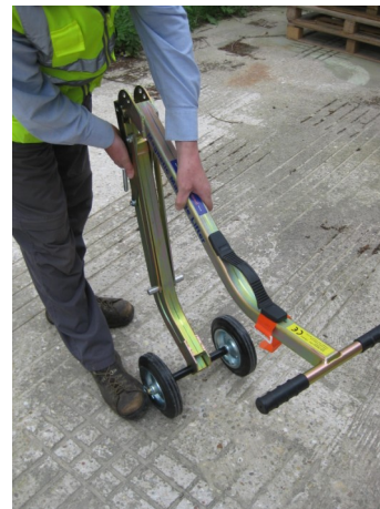
Fold handle section forward