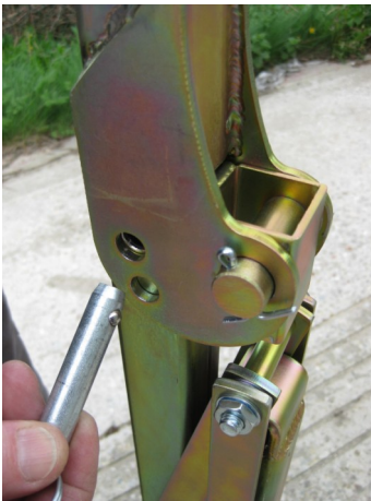
Insert locking pin (see right for alternatives)