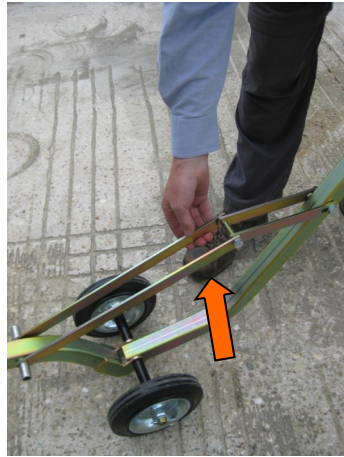
Raise front arm by lifting stay bars in front of joint