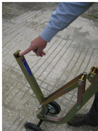
Push front arm forward ..