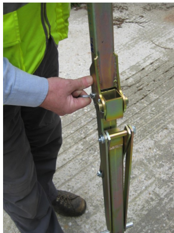
Remove locking pin