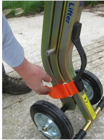
Undo Velcro strap