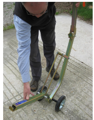
... until stay bars are straight

Before using the Lifting Trolley, check all pins, bolts and clips are in place and secured. Check also for any visible signs of misalignment or damage. DO NOT operate damaged equipment.